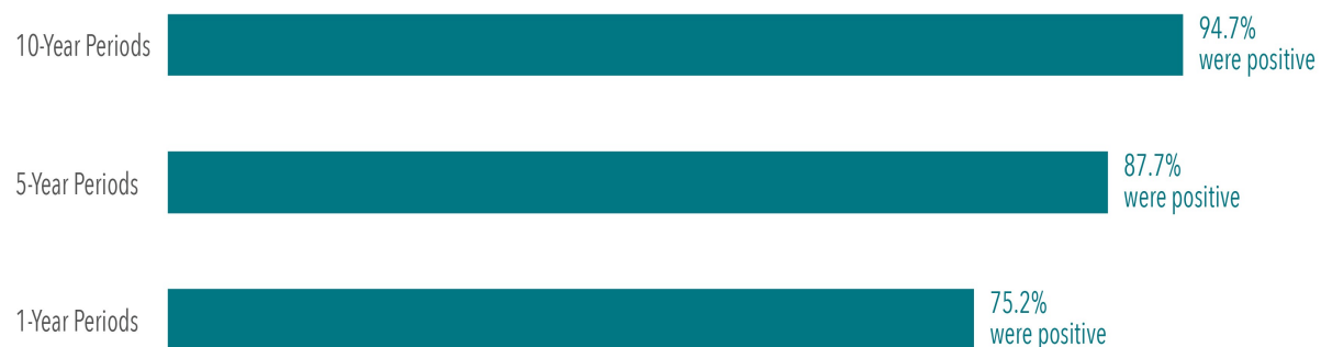
Exhibit 2. Frequency of Positive Returns in the S&P 500 Index Overlapping Periods: 1926–2018

In US dollars. From January 1926–December 2018, there are 997 overlapping 10-year periods, 1,057 overlapping 5-year periods, and 1,105 overlapping 1-year periods. The first period starts in January 1926, the second period starts in February 1926, the third in March 1926, and so on. S&P data © S&P Dow Jones Indices LLC, a division of S&P Global. Indices are not available for direct investment. Index returns are not representative of actual portfolios and do not reflect costs and fees associated with an actual investment. Past performance is no guarantee of future results. Actual returns may be lower.